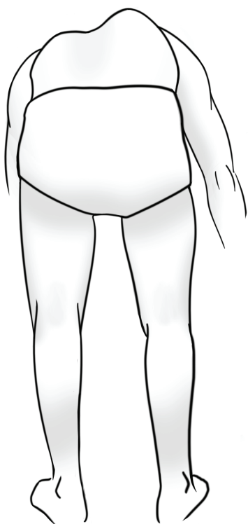
Adams forward bend test Drawing courtesy of Dustin Horn.

The child who is able to stand faces away from the examiner, then bends forward at the waist with the knees straight and the arms hanging down passively (see Figure 2). The practitioner looks at the spine from behind and notes any rib, thoracic, scapular, or lumbar prominence that could indicate a rotational spine deformity. 1,4,7 In some instances, the use of a scoliometer can be helpful to assign a number to the amount of rotation to the spine during the Adams forward bend test. However, primary care offices are not often equipped with this device. 26