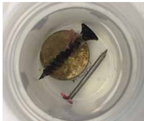
A coin, nail, and screw were successfully removed from the right main stem bronchus.

can be a valuable option for foreign objects removal, especially those distally located in the lung segments as well as in those medical centers where rigid bronchoscopy is not available.