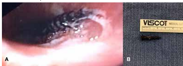
Screw was lodged (A) and removed (B) from the right main stem bronchus.

airway foreign bodies. 1 The rigid bronchoscopy provides the ability to function as an endotracheal tube, thus allowing control of the airway and a conduit through which foreign bodies can be removed. 1 Nonetheless, sometimes retrieval of foreign bodies deeper into the subsegmental bronchi cannot be achieved. 1 Moreover, the required equipment or knowledgeable staff is not always available. 1 Therefore, flexible bronchoscopy is an option to retrieve airway foreign bodies especially those located distal in the airway and for those medical centers without rigid bronchoscopy as is the case in our institution.