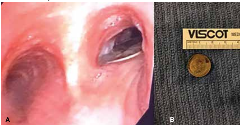
Disk-shaped metallic foreign body at the right main stem bronchus (A) that was remarkable for a coin after removal with tripod retrieval tool (B).

despite having had a coin, nail, and screw aspiration (Figure 6).