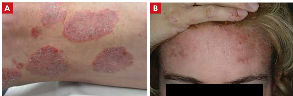
Sharply demarcated pink plaques with silvery scales are commonly seen on the extensor surfaces (A), the scalp (B), trunk, and lumbosacral area.