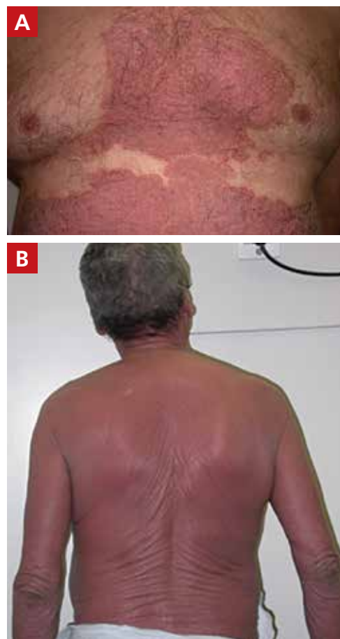
This form of psoriasis involves at least 75% of the body with erythema and scaling, and can be difficult to differentiate from such conditions as atopic or seborrheic dermatitis and pityriasis rubra pilaris.