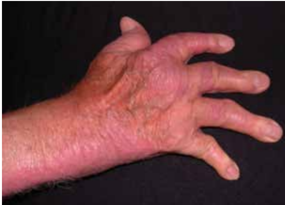
Pictured here is arthritis mutilans of the hand. Note the shortening of the digits due to bony destruction. The resulting excess skin becomes folded and retracted in an appearance similar to telescoping "opera glasses."

aggravated. Drug-induced psoriasis will improve after discontinuation of the causative drug and tends to occur in patients without a personal or family history of psoriasis. Drug-aggravated psoriasis continues to progress after the discontinuation of the offending drug and is more often seen in patients with a history of psoriasis. 14 Drugs that most commonly provoke psoriasis are beta-blockers, lithium,