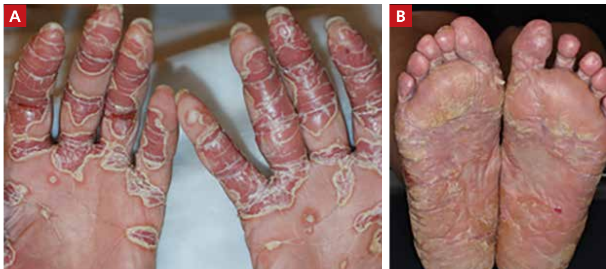
Palms of the hands (A) or soles of the feet (B) exhibit psoriatic plaques with well-demarcated erythematous scaling lesions. Palmoplantar psoriasis can also involve thickening and scale without associated erythema (not shown).