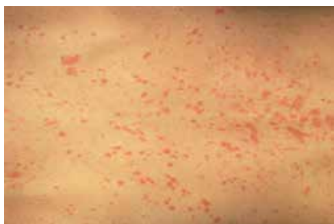
The small, pink scaly papules of guttate psoriasis appear suddenly, and usually in children who have an upper respiratory tract infection.

making careful clinical observation crucial to arriving at an accurate diagnosis.