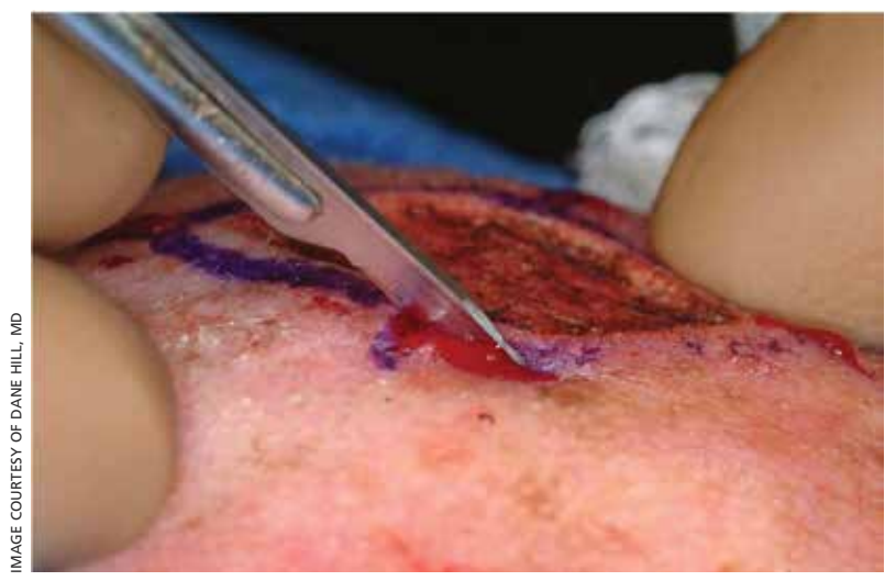
The Mohs surgeon uses a 45° angle, with the tip of the scalpel pointing toward the lesion and the handle pointing away from it, in order to bevel the tissue being excised.

make a nick at the 12 o'clock position. Following removal of the first stage, the nick will be visible on both the extirpated tissue and the tissue just above the surgical defect. This prevents potential confusion regarding orientation during tissue processing.