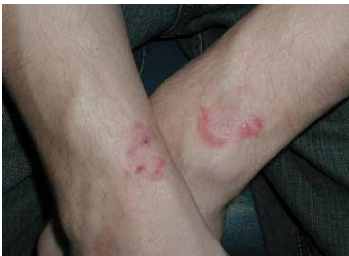
Bilateral, erythematous plaques on both wrists

IMAGE COURTESY OF: STEPHEN E. HELMS, MD, FAAD