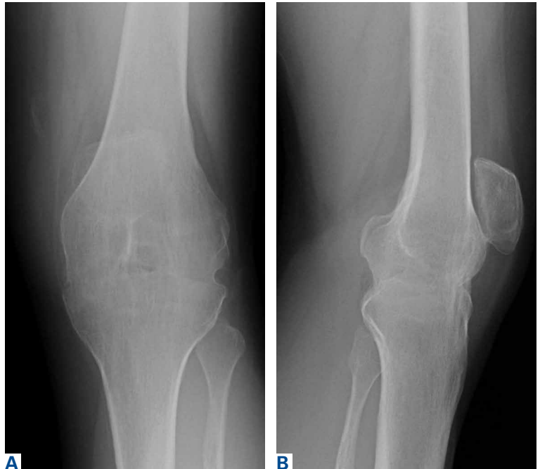
Figure 5. (A) Anteroposterior and (B) lateral radiographs show ankylosed left knee in extended position with intact patellofemoral joint, February 2015.

Am J Orthop. 2017;46(2):E83-E85. Copyright Frontline Medical Communications Inc. 2017. All rights reserved.