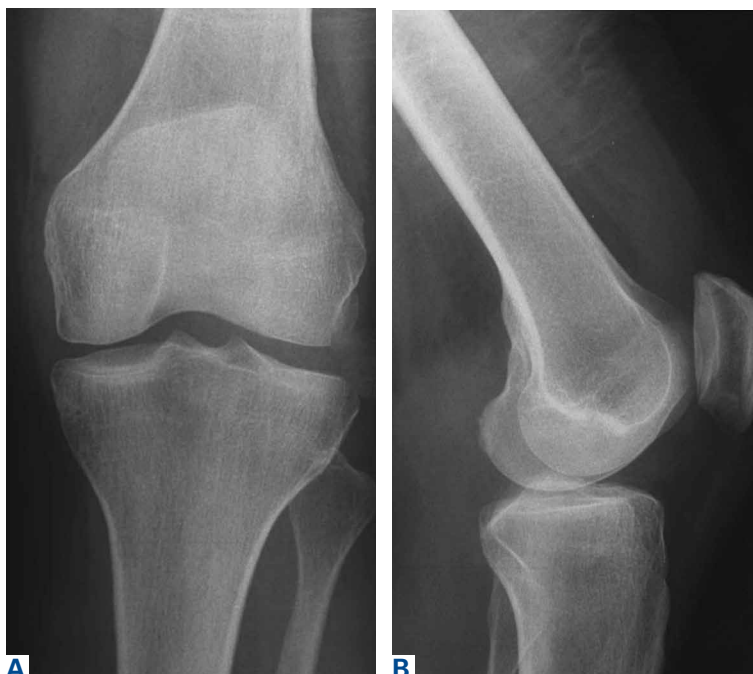
Figure 1. (A) Anteroposterior and (B) lateral radiographs of normal left knee, April 2002.

On initial referral to the department, in 2002, the patient, age 38 years at the time, had a 1-year history of progressive left knee stiffness and reduced range of motion (ROM). At the time, she recalled injuring the knee during an aerobics class 2 months prior. A physiotherapy trial (ROM actively and passively assessed 10°-90°) failed. All movement was painful, and 2 crutches were needed for ambulation. The patient was treated nonoperatively with analgesia and was advised to return to physiotherapy. Plain radiographs showed a small effusion but no