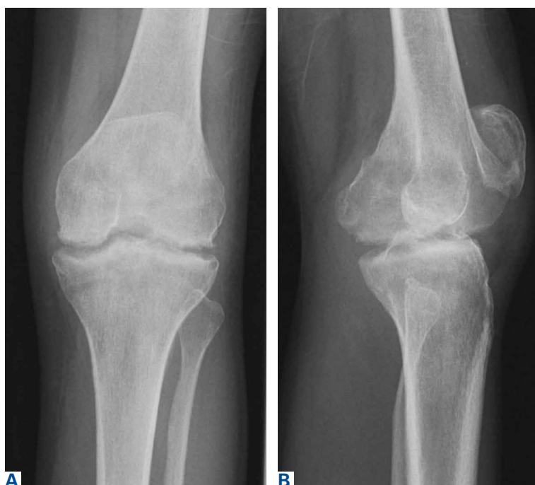
Figure 3. (A) Anteroposterior and (B) lateral radiographs of left knee show subchondral irregularity and sclerosis without joint-space narrowing, August 2002.