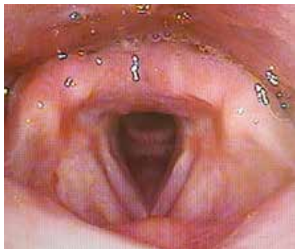
Vocal cords showing the loss of available airflow capability; this motion can vary in severity.