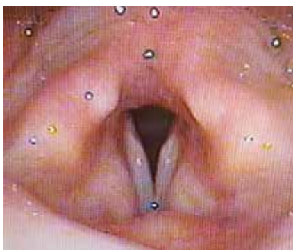
Figure 2. Paradoxical Adduction of Vocal Cords During Inspiration

1 patient was diagnosed by Pulmonology on-base via direct visualization, and 2 patients were diagnosed by ENT on-base via direct visualization. These patients had direct laryngoscopy completed, often to rule out other organic causes for upper airway disease processes, and were found to have visual paradoxical vocal cord movement. Ninety-eight patients completed PFTs. Several patients were lost to follow-up, as can be common in a military population with frequent moves or members leaving service.