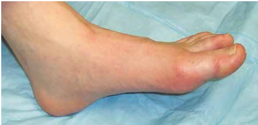
Figure 1. Gout Involving the First Metatarsophalangeal Joint

The first metatarsophalangeal joint is the most common site for acute gout attacks, known as podagra.