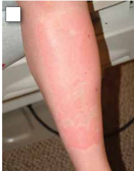
1. Raised, often itchy, red bumps on the surface of the skin, usually from an allergic reaction.