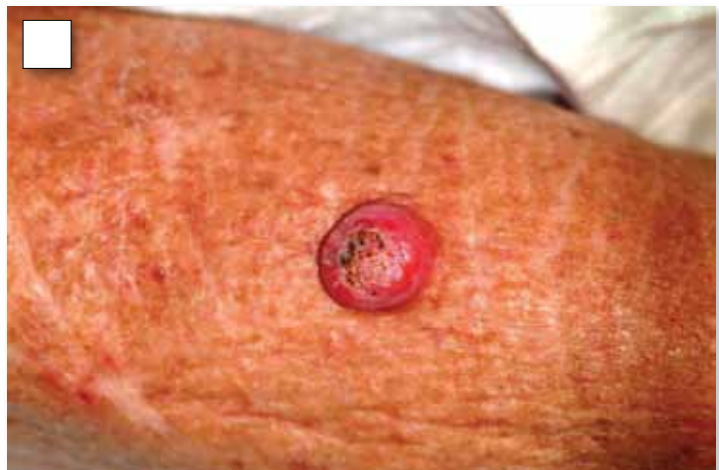
4. Solid or cystic raised bumps measuring more than 1 cm but less than 2 cm in width.

Reprinted with permission from Cutis . 2014;94(1):13-16.