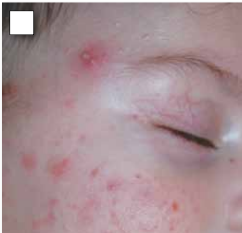
3. Small, inflamed, pus-filled, blister-like lesions on the skin surface, commonly found in acne.

Reprinted with permission from Cutis . 2014;94(1):13-16.