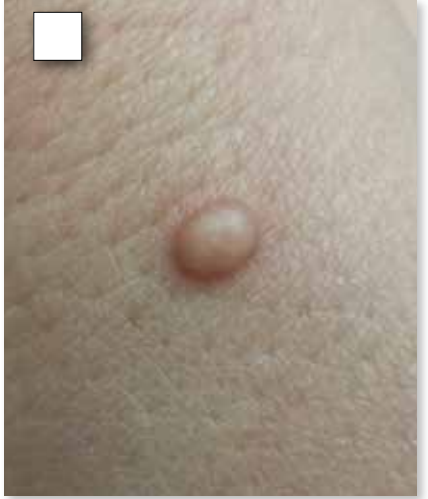
2. Solid or cystic raised area less than 1 cm wide.