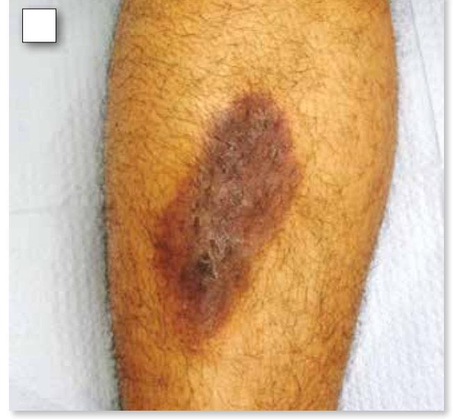
4. Resulting from chronic irritation related to conditions such as eczema or from continuous rubbing or scratching, the skin becomes thickened and leathery.

For the correct answers, go to www.clinicianreviews.com/articles/picture-this.html.