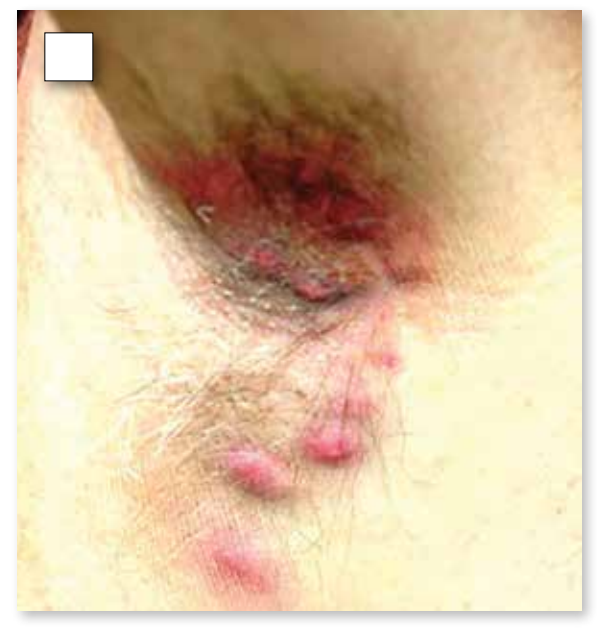
3. Collection of pus in any part of the body, typically accompanied by swelling and inflammation.