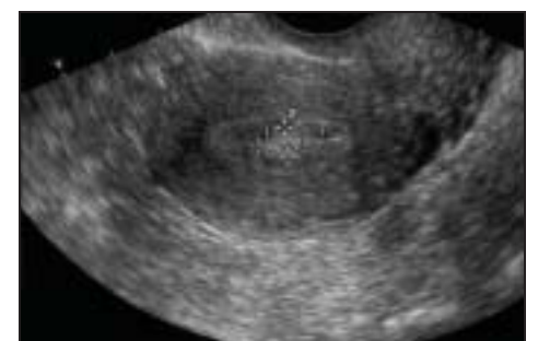
A focal abnormality on grayscale ultrasound suggests an endometrial polyp.