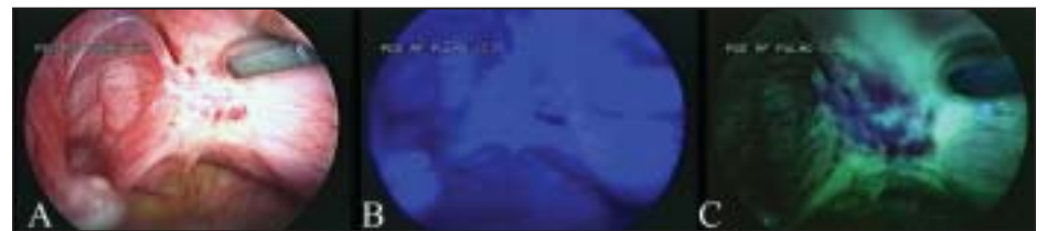
In regular endoscopy, white light is used (A). The light is filtered from white into a narrower, blue range (B). Reflected blue light is filtered; endometrial lesions may appear dark blue if they block the green background fluorescence, now visible (C).

In contrast to the classical dark, black, hemosiderin-like endometrial lesions that can