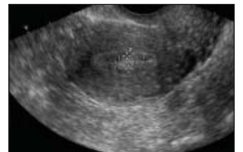
A focal abnormality on grayscale ultrasound suggests an endometrial polyp.