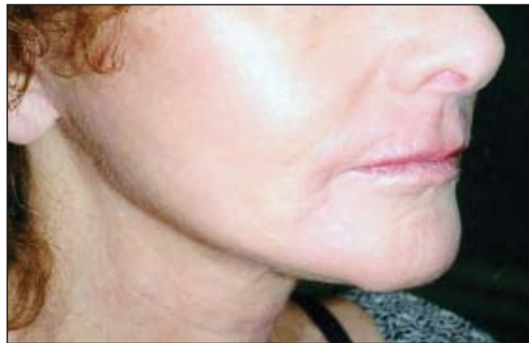
A patient is shown before and after undergoing cosmetic surgery with the "long-lasting, effective" QuickLift technique.

level of the superficial musculoaponeurotic system (SMAS) and usually involves plication.