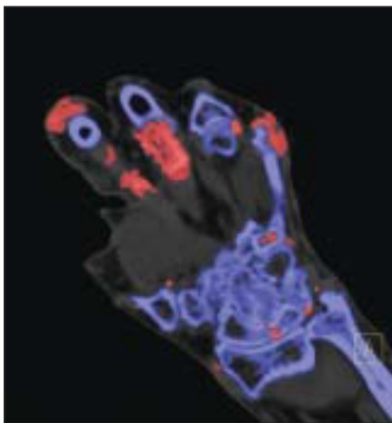
DECT shows uric acid deposits in red, while calcium in bone looks blue.

The current proof-of-concept study, in addition to assessing the accuracy of DECT in gout patients, also measured the uric acid burden in peripheral joints and performed a computerized quantifi-