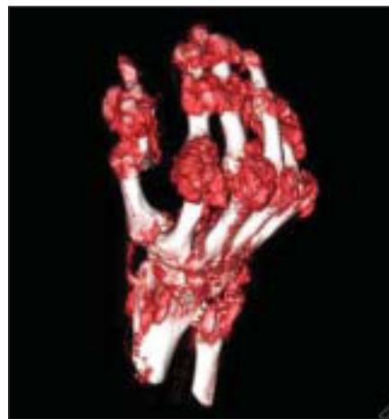
A 3-D volume-rendered image of the same patient shows many tophi (red).