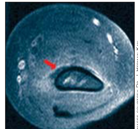
Corresponding T1-weighted image of humerus shows subperiosteal abscess.