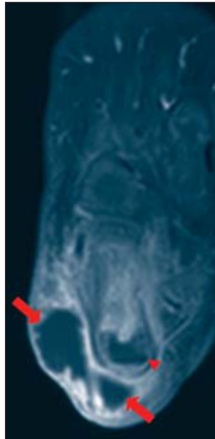
Right foot after administration of IV gadolinium shows large soft tissue abscess (arrows) and intraosseous calcaneal abscess (arrowhead).

The ninth subject was diagnosed with acetabular osteomyelitis based on evidence of marrow and soft-tissue edema