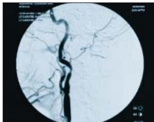
Angiogram shows a narrowing of the internal carotid artery (near the center of the image).