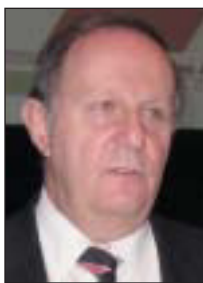
The evidence so far is suggestive enough to prompt caution in the treatment of patients with a thiazolidinedione.

Perhaps the most persuasive evidence so far is a meta-analysis