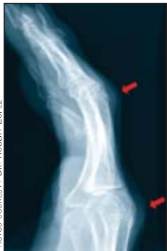
Periarticular soft-tissue fullness is visible on x-ray.