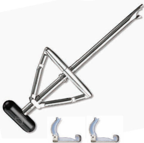
[Clips Shown Actual Size]