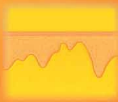
Immune cells clear precancerous and cancerous lesions.

Toll-like receptors. Located on the surface of antigen-presenting cells, such as Langerhans and other dendritic cells, Toll-like receptors are a family of 10 members, each of which recognizes signals of damaged cells or microbes. 8 Activation of Toll-like receptors leads to production of cytokines and chemokines, such as INF- \alpha , TNF- \alpha , IL-12, MCP-1, and MIP-1 \alpha . 9,10 The