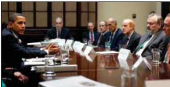
President Obama called the meeting held to discuss cost savings in health care "a watershed event."

The American Medical Association told the president that although evidence-based guidelines will be helpful in reducing costs, the reductions could be enhanced if physicians had more liability protection. "For example, if everyone who walks into the emergency room gets