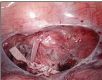
Figure 2. Mersilene tape is tied extracorporeally upon clarified pubocervical fascia in a 12 weeks' gravid uterus.

Whereas patients undergoing laparoscopic cervicoisthmic cerclage still must have a laparotomy at the end, because the