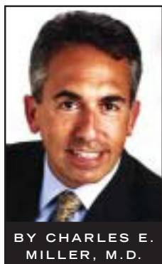
BY CHARLES E. MILLER, M.D.

Cervical cerclage involves the placement of sutures, wires, or synthetic tape to mechanically increase the tensile strength of the cervix. The procedure is done either electively or emergently (rescue) to reduce the risk of cervical insufficiency and the resultant second-trimester