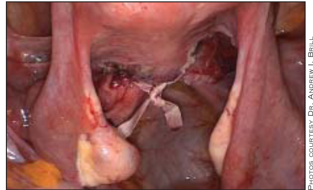
Figure 5. Mersilene tape is tied extracorporeally during interval cervicoisthmic cerclage.

The large needles still attached to the tape are introduced into the abdomen