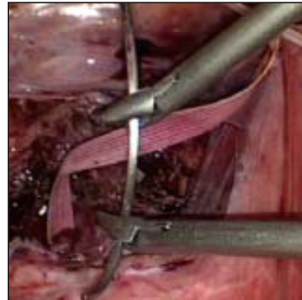
Figure 4. Needle is positioned for completion of cervicoisthmic cerclage after prior trachelectomy.

A 5-mm Mersilene tape is prepared by removing the attached curved needles, and the suture is then introduced into the posterior pelvis through the 10-mm suprapubic port. A 10-mm right-angle forceps through the suprapubic port is used to grasp and position the ligature around the lower uterine segment at the level of the isthmus by first piercing through the surgical windows in an anterior-to-posterior direction to then grasp and withdraw each end of the su-