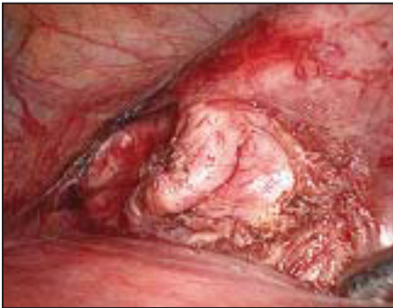
Figure 1. Uterine artery is skeletonized at isthmus for medial stitch placement in an 11 weeks' gravid uterus.

higher is better principle less invasively with more ease and superior precision. Compared with the vaginal or laparotomic approach, the laparoscopic method provides less trauma to the gravid uterus and unparalleled visual and mechanical access to the key anatomical structures either incorporated or potentially injured during cervicoisthmic cerclage. Placing the stitch precisely at the correct level is the most important element of this procedure.