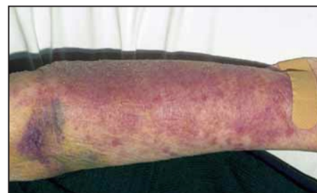
An eczematous reaction on the left arm of an RA patient on infliximab is shown.

In the trial, 289 consecutive patients with RA who were started on TNF- \alpha -blocking therapy—infliximab, etanercept, adalimumab, or the experimental agent lenercept—were compared with 289 patients from a cohort of 500 who have