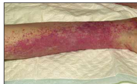
A similar eruption occurred on the right leg of the same patient.

Overall, 167 patients were given infliximab, 108 received adalimumab, 78 received etanercept, and 31 were treated with lenercept. In total, there were 128 dermatologic events in the TNF group; 56 events occurred with adalimumab, 49