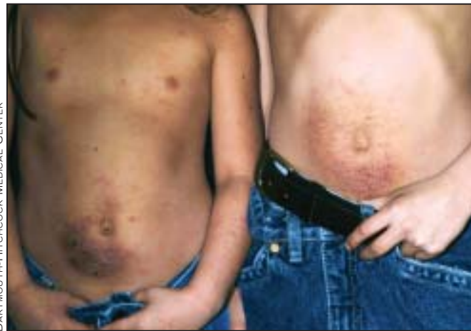
The nickel allergy with autoeczematization in these siblings was probably caused by belt buckles or clothing snaps.

► Prevention of contact allergy to nickel is challenging. The best approach is to find ways to reduce sensitization. Regulation of nickel release from consumer goods "would be a challenging but potentially successful solution," wrote the authors, who reported no conflicts of interest. ■