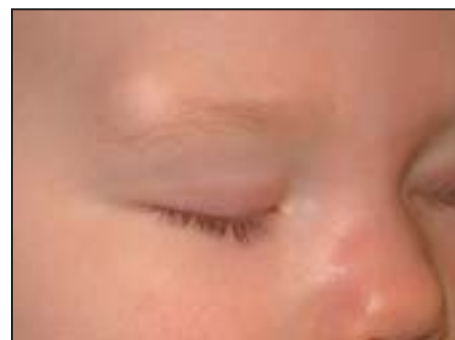
Dermoid cysts at the lateral third of the eyebrow don't need radiologic imaging.