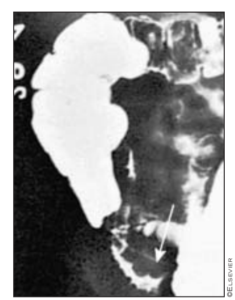
Barium enema postevacuation film shows marginal filling defects in the distal ileum in Henoch-Schönlein.

He reported that he did not have any conflicts of interest in regards to his presentation. SDEF and this news organization are owned by Elsevier.