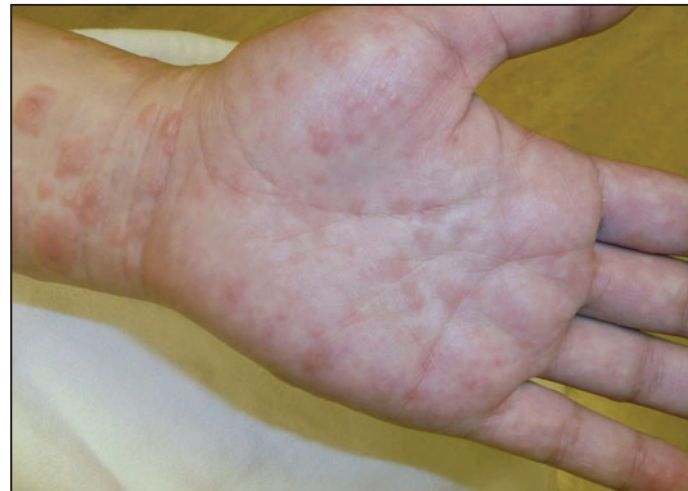
Erythematous edematous papules and vesicles are evident on the palm in this case of pemphigoid gestationis.

autoimmune blistering disease unique to pregnancy. It occurs in 1 in 50,000 pregnancies and is probably the least common dermatosis of pregnancy. The onset is usually in the second or third trimester, but in about 14% of cases, the onset can occur post partum. With pemphigoid gestationis, there is no change in maternal outcome, but there are risks to the fetus including being small for gestational age, preterm delivery, and neonatal pemphigoid disease.