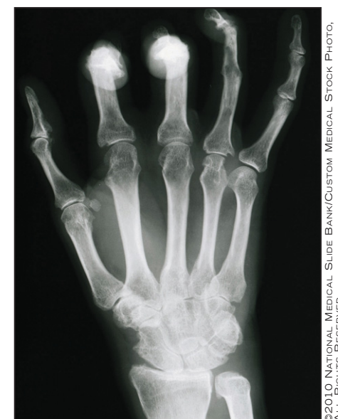
The x-ray shows distal phalangeal joint damage from psoriatic arthritis.

tients achieved MDA after 24 weeks of study (P = .001). At 1 year, when all patients were receiving infliximab, 40% of patients were in MDA. Again, comparing the patients who were in MDA at week 52 with those who were not showed that 78% and 57% showed no signs of radiologic progression (P = .009).