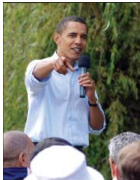
Sen. Barack Obama's plan also includes a universal coverage mandate for children.

"I want to wake up and know that every single American has health care when they need it, that every senior has prescription drugs they can afford, and that no parents are going to bed at night worrying about how they'll afford medicine for a sick child," Sen. Obama said in June during a health care town hall meeting in Bristol, Va.