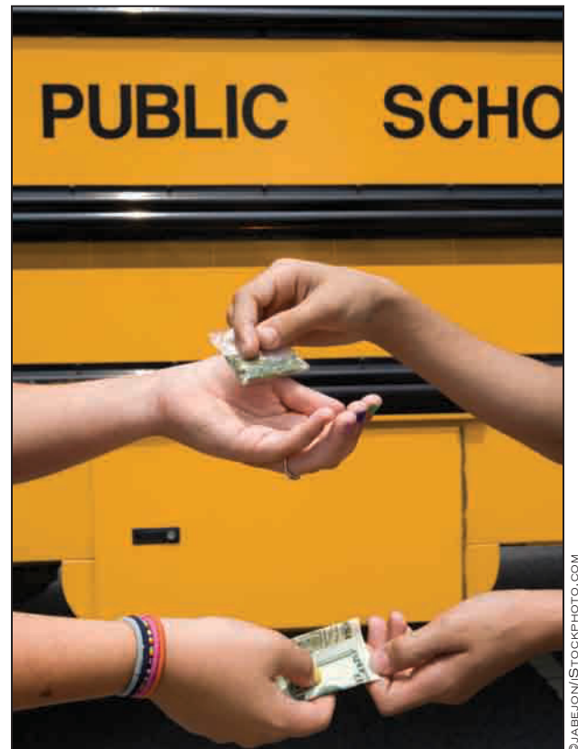
Adolescents reporting drugs and gangs at their schools were five times more likely to have used marijuana.

CASA data point to the need for new treatment programs for adolescents with drug problems.