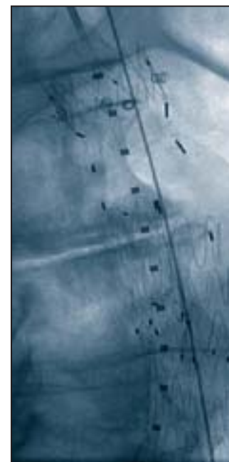
The completed endograft has four transmural staples and two modular limbs that are deployed and locked into the main body.