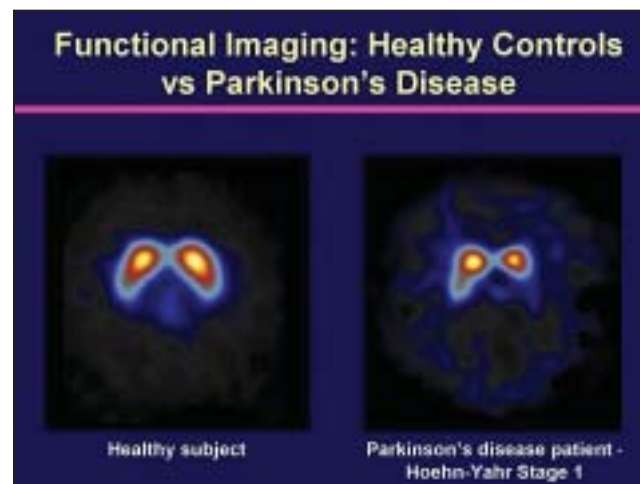
Imaging can detect asymptomatic neurologic changes. A SPECT scan of a patient with early PD shows reduced dopamine transporter binding on the as-yet unaffected side.

Constipation is another common finding during premotor PD, as shown by the lon-