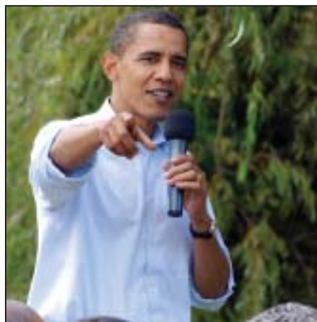
Sen. Barack Obama says his plan would save the average family $2,500 a year.

Cost control also is addressed in the Obama plan, with electronic health records playing a big role. The candidate proposes to spend $10 billion a year for the next 5 years in an effort to encourage adoption of EHRs. The plan also seeks to control costs through greater regulation of insurance companies and by allowing the fed-