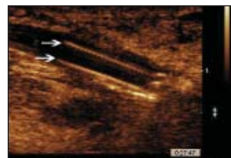
Arrows show a balloon's blades across the severe focal stenosis in the femoral to plantar artery vein bypass graft.