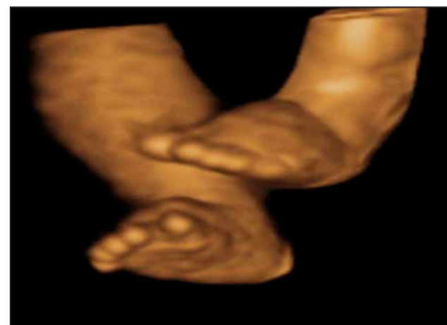
Swelling involving the dorsal aspect of both feet in a fetus with Turner syndrome is shown here on 3D ultrasound.