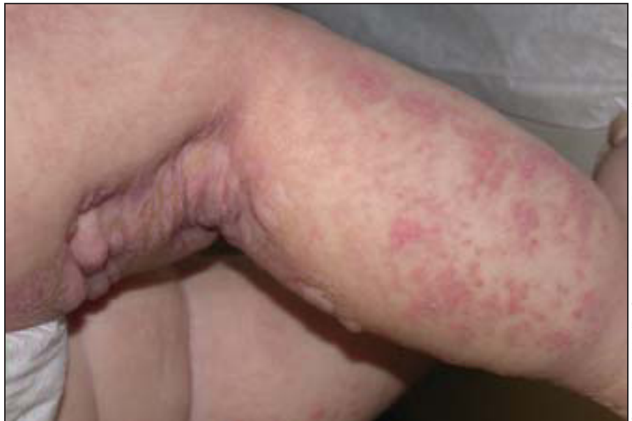
Symmetric linear red macules and soft spongy plaques are among the features characteristic of Goltz syndrome, which is known to be X-linked dominant.

Neurofibromatosis type 1-like (NF-1-like) syndrome shares the neurofibromatosis type-1 characteristics of multiple café-au-lait spots, axillary freckling, and macro-