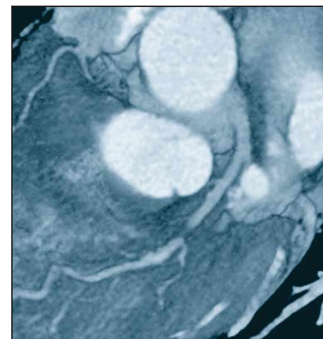
CT angiography reveals high-grade stenosis (dark area) in the mid-left anterior descending coronary artery.

CT angiography may be the best technique for imaging the results of bypass