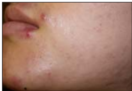
A 31-year-old female patient is shown before treatment (top). Improvement is seen after one session (bottom).