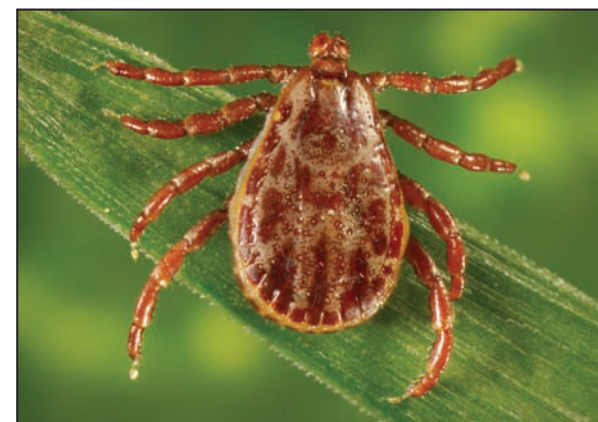
The Rocky Mountain wood tick Dermacentor andersoni is a vector of Rocky Mountain spotted fever.

Death usually is from respiratory failure. For more than half a century, there have been post-mortem reports of ticks being found embedded in the skin of people who died suddenly of unexplained paralytic illnesses.