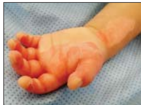
The child's burn is first cleaned with chlorhexidine and then bullae and nonviable tissue are removed (left). A Biobrane glove is then placed over the hand (right).