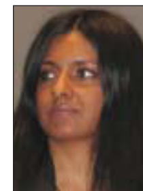
‘Previous studies of cardiovascular mortality have not controlled for traditional CV risk factors, as our work has done.’

After researchers controlled for traditional cardiovascular risk factors, psoriasis patients had a clinically significant increased risk of cardiovascular death (hazard ratio [HR] 1.55). This risk was modified by age, with patients aged 40 and younger being at greater risk (HR 2.65) than patients aged 41-60 (HR 1.90). This translated to an excess of 5.78 cardiovascular deaths per 10,000 person-years at age 40 and 58.9 per 10,000 person-years at age 60, she said.