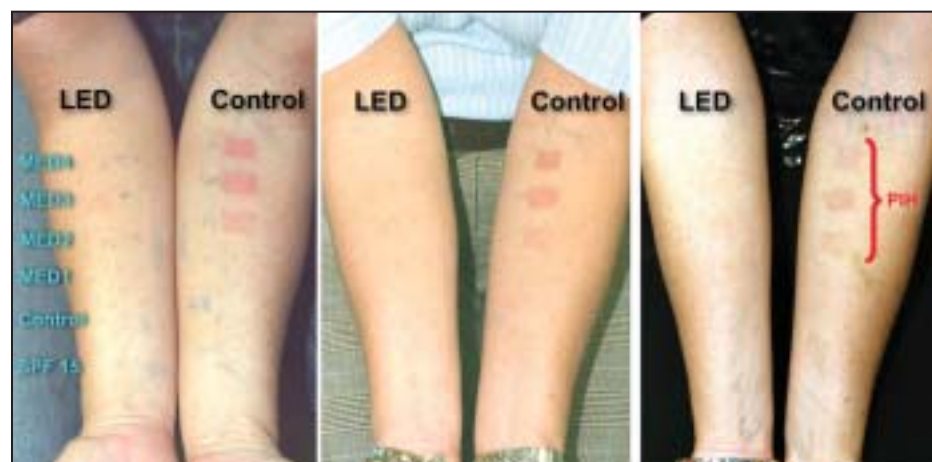
The right arms of patients received three doses of infrared light over 6 days prior to indicated dosages of ultraviolet B exposure. Infrared pretreatment reduced both acute erythema and long-term, postinflammatory hyperpigmentation (PIH).

The subjects received their prespecified infrared regimen on the skin of their right arms, with their left arms remaining untreated and acting as controls. A patch on both arms was also treated with an SPF-15 sunscreen. Following pretreatment, both arms received a series of escalating