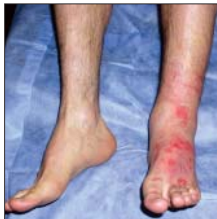
This patient's swollen ankle and shallow ulcers were caused by neurogenic edema, which may be triggered by the loss of small-fiber nerve endings.

Results of ipsilateral and contralateral