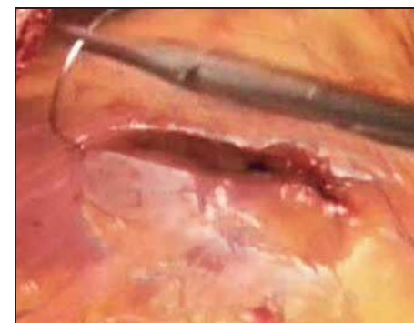
This image shows the surgical incision being repaired.

eral Infirmary. The suturing also reduces functional mitral regurgitation. It is generally combined with coronary bypass grafting.