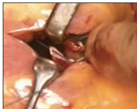
This image shows the sutures being tied in the novel procedure.