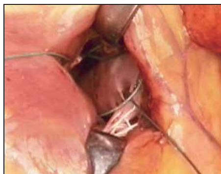
This image shows the placement of the sutures through the trabeculae.