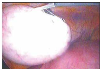
The cyst is dissected off the ovarian tissue, using laparoscopic scissors.