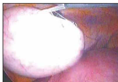
The cyst is dissected off the ovarian tissue, using laparoscopic scissors.