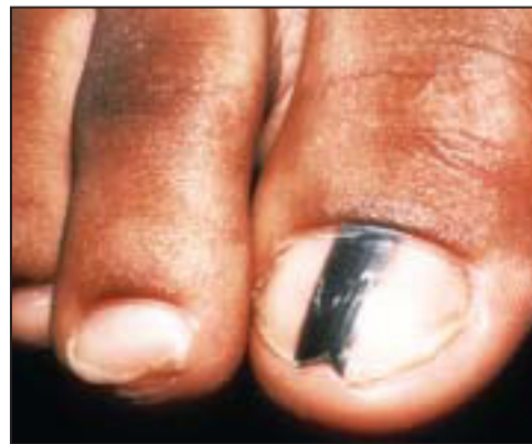
Subungual melanoma often presents initially as longitudinal melanonychia.