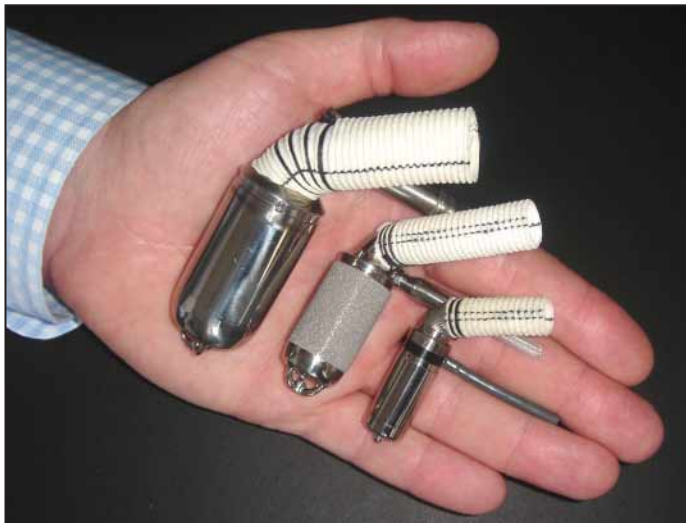
Pumps for the Jarvik 2000 booster VAD for adults (left) are being developed for children (center) and infants (right).