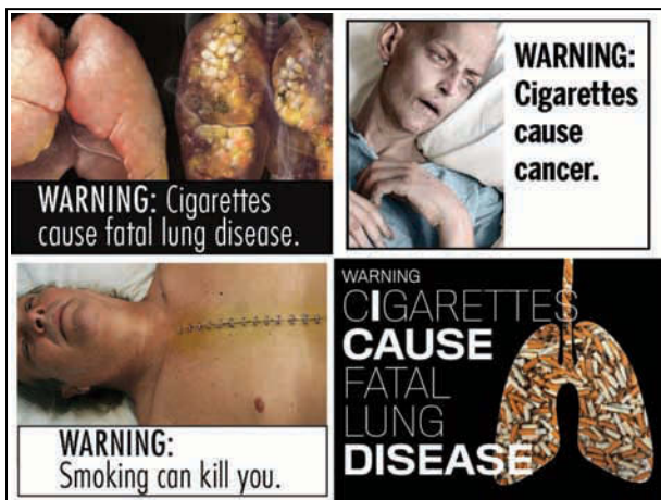
The FDA says graphic depictions of the dangers of smoking should take up half a cigarette package.

“Every day, almost 4,000 youth try a cigarette for the first time and 1,000 youth become regular, daily smokers,” HHS Secretary Kathleen Sebelius said in a statement. “Today marks an important