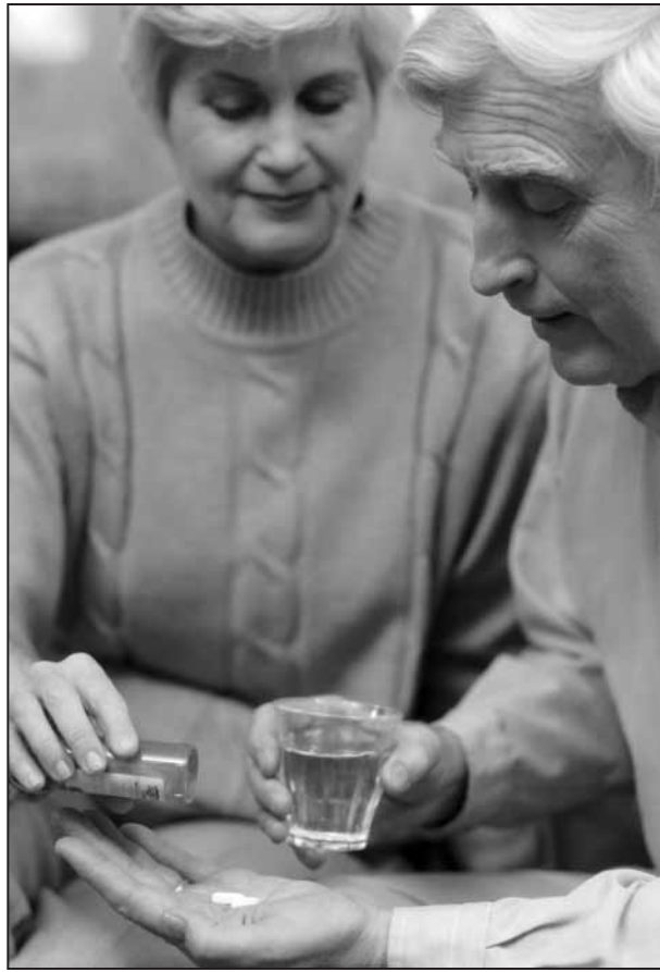
For many spouses, administering medications to loved ones becomes a responsibility after the onset of MCI.